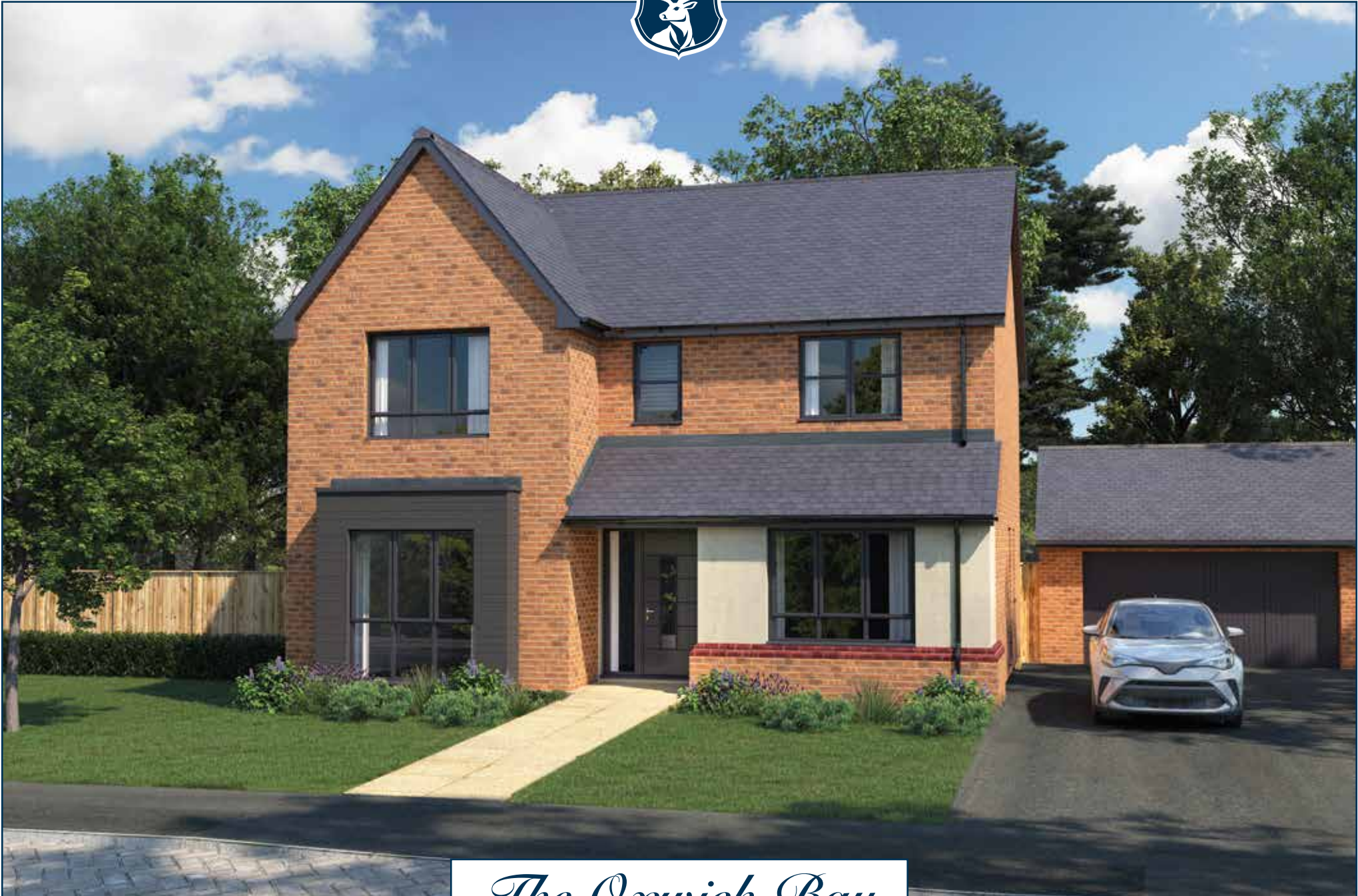
The Oxwich Bay